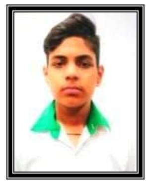
PRINCE RANA 83.4%