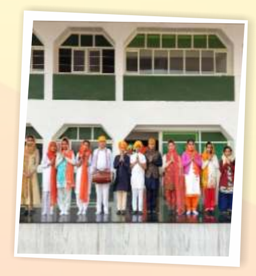
Gurupurab Celebration 22.11.18