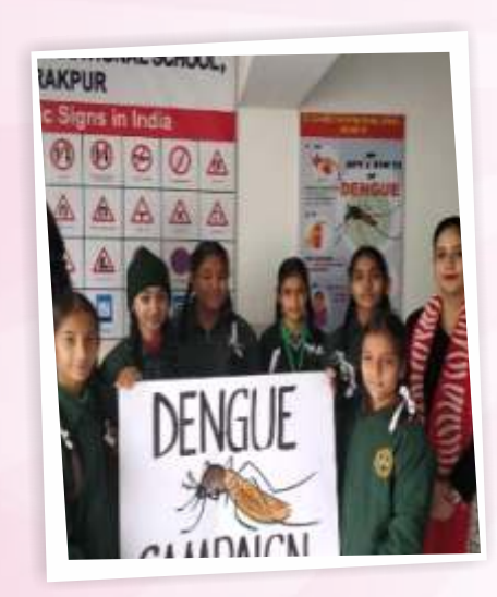
Dengue Awareness Camp 15.01.19