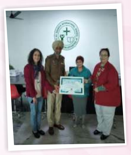
Safe School Vahan Scheme Seminar 08.02.19