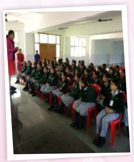
Health and Hygiene Workshop 25.02.19