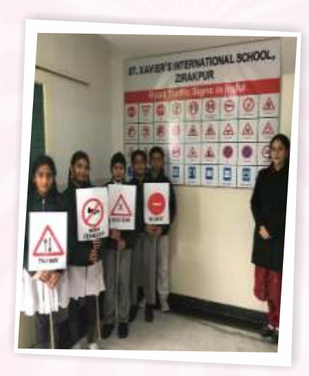
Traffic Rules Workshop 06.02.19