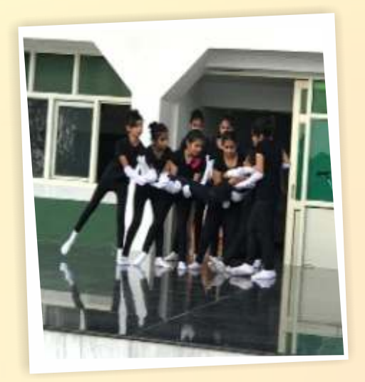
Children's Day 14.11.18