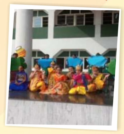
Janmashtmi Celebration 27.08.18