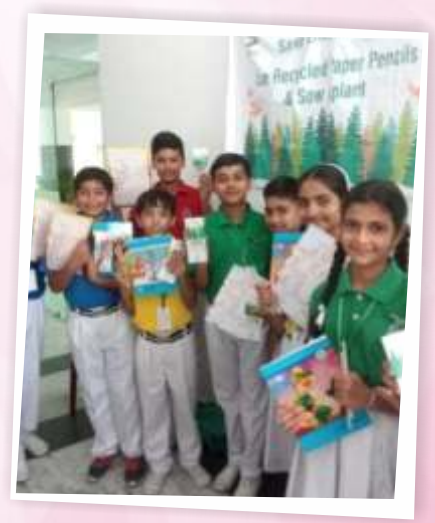
Save Trees Save Environment Week