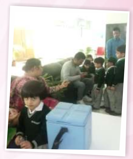
Pulse Polio Camp 19.11.18