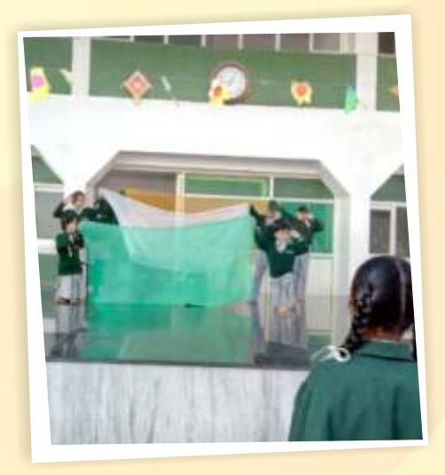
Independence Day Celebration 14.08.18