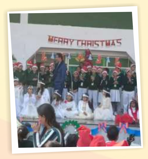
Christmas Celebration 21.12.18