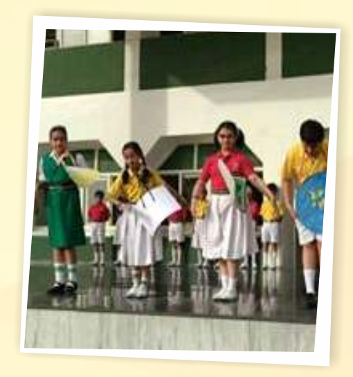
Earth Day 20.04.18